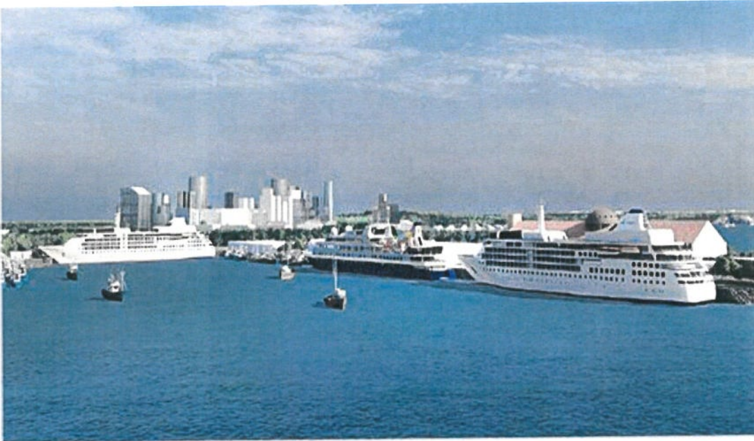
The new tourist city in Galle is designed to attract more foreign cruise vessels to boost tourism