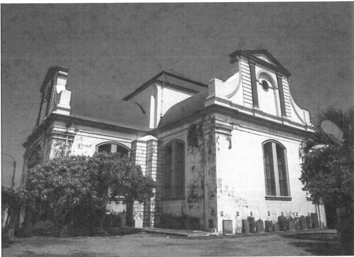
Wolvendaal Church in Colombo – the oldest Dutch Reformed Church in Sri Lanka

The Dutch Burgher Union also contains and preserves many of these journals that have been created and maintained throughout the years, revealing that each family line is not only of Dutch origin; these families have German, Swedish, Hungarian, Italian, French, British, Portuguese and Sinhalese ancestor as well.